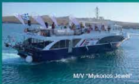
M/V "Mykonos Jewel"

The route will take you along Little Venice where you will have the chance to admire the stunning view of Mykonos Town dressed in the lovely colours of sunset. What's more, you will get a glimpse of Mykonos' iconic Windmills, which have been the landmark of the island for a very long time. Last but not least, we offer a fantastic range of snacks on board which you can savour throughout the trip.