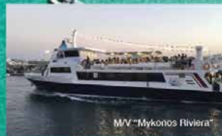
M/V "Mykonos Riviera"

M/V "Mykonos Jewel" (ultra-luxury boat):